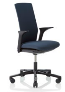
HÅG Futu 1200-S FutuKnit solid Dusk – FTU102