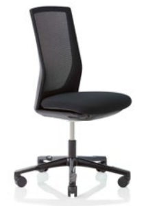
HÅG Futu Comm mesh 1102** FutuKnit mesh Night – MEH099