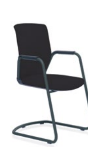
HÅG Futu Comm 1070 FutuKnit solid Night – FTU099