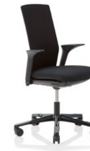
HÅG Futu 1200-S FutuKnit solid Night – FTU099