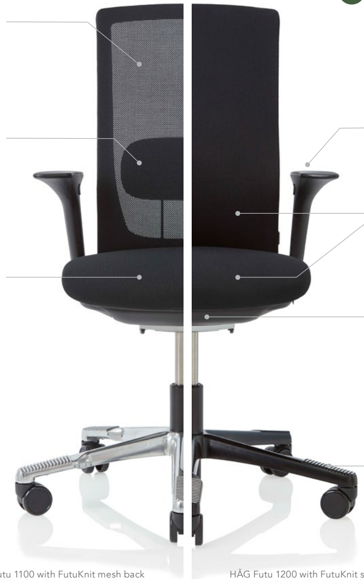
HÅG Futu 1100 with FutuKnit mesh back

7 appealing colours Select from seven matching fabrics and mesh colours – FutuKnit mesh (back) and FutuKnit solid (seat and back).