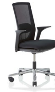
HÅG Futu 1100-S* FutuKnit mesh Night – MEH099