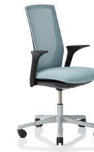
HÅG Futu 1100-S FutuKnit mesh Frost – MEH100