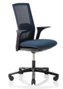
HÅG Futu 1100-S* FutuKnit mesh Dusk – MEH102