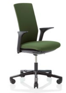
HÅG Futu 1200-S FutuKnit solid Forest – FTU104