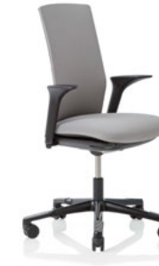
HÅG Futu 1200-S FutuKnit solid Stone – FTU101