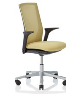
HÅG Futu 1100-S FutuKnit mesh Straw – MEH105